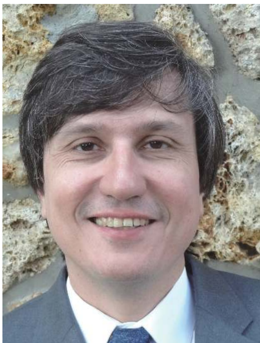
马克西姆·康采维奇 (Maxim Kontsevich)

我 1964 年出生于莫斯科市郊，周边是一大片森林。我父亲是位著名的韩国语文及历史专家，母亲是位工程师，现在已经退休，哥哥是电脑视觉专家。我幼年时候一家人住在狭小的公寓里，家里放满了书，其中有一半是韩文或中文书籍。