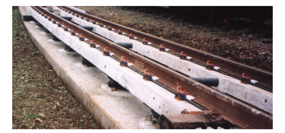
Figure 1: FLT test installation at the RTRI (courtesy H. Wakui).