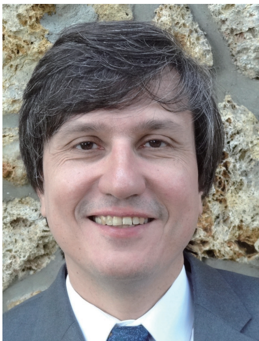
马克西姆·康采维奇 (Maxim Kontsevich)

我 1964 年出生于莫斯科市郊，周边是一大片森林。我父亲是位著名的韩国语文及历史专家，母亲是位工程师，现在已经退休，哥哥是电脑视觉专家。我幼年时候一家人住在狭小的公寓里，家里放满了书，其中有一半是韩文或中文书籍。